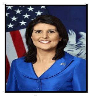
Governor Nikki Haley