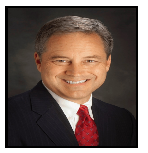
Governor Sean Parnell